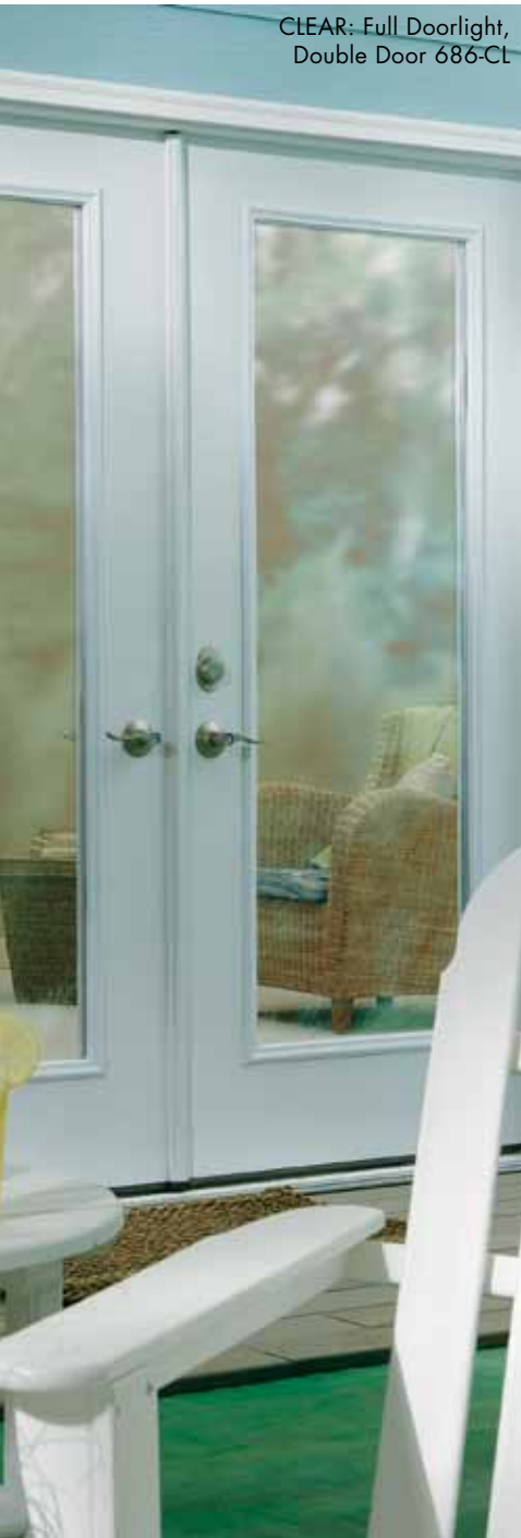
CLEAR: Full Doorlight, Double Door 686-CL