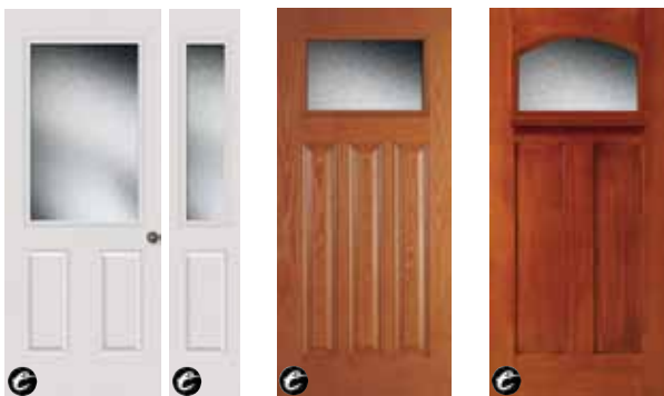
684-DGC 692-DGC Sidelight