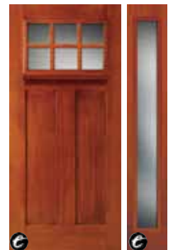
818-MG* 819-MG* Sidelight