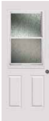
799-RN Privacy Glass