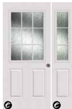
681-RN 693-RN Sidelight