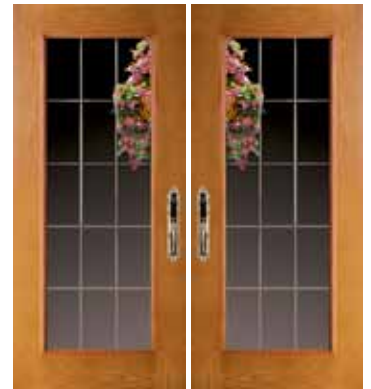
Full Doorlight, Double Door 686/687-CC

CUT CRYSTAL GLASS DESIGN: Full Doorlight 686-CC, Full Sidelight 694/690-CC