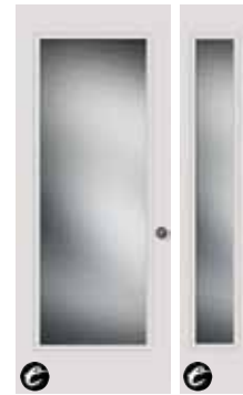
686/687-MG 694/690-MG Sidelight