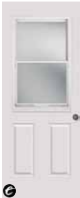
799/199-CL Clear Glass