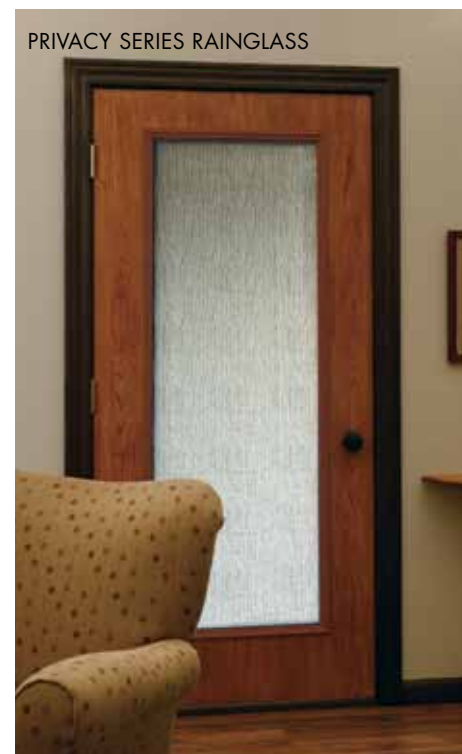
PRIVACY SERIES RAINGLASS