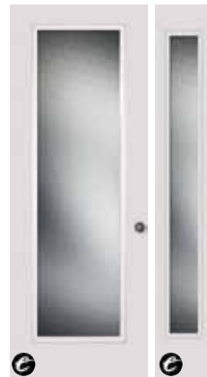
Full 8'0" 612-MG 493-MG Sidelight