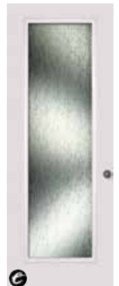
Full 8'0" 612-RN