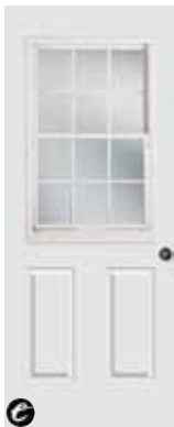
799-GBG Clear Glass