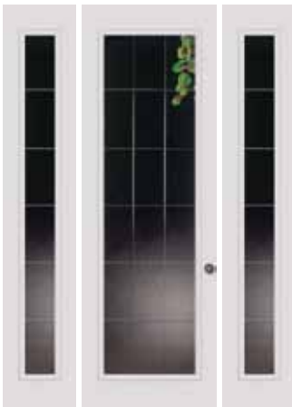
Full 8'0" Doorlight 612-CC Full 8'0" Sidelights 493-CC