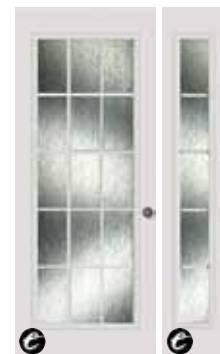
689/688-RN 695-RN Sidelight