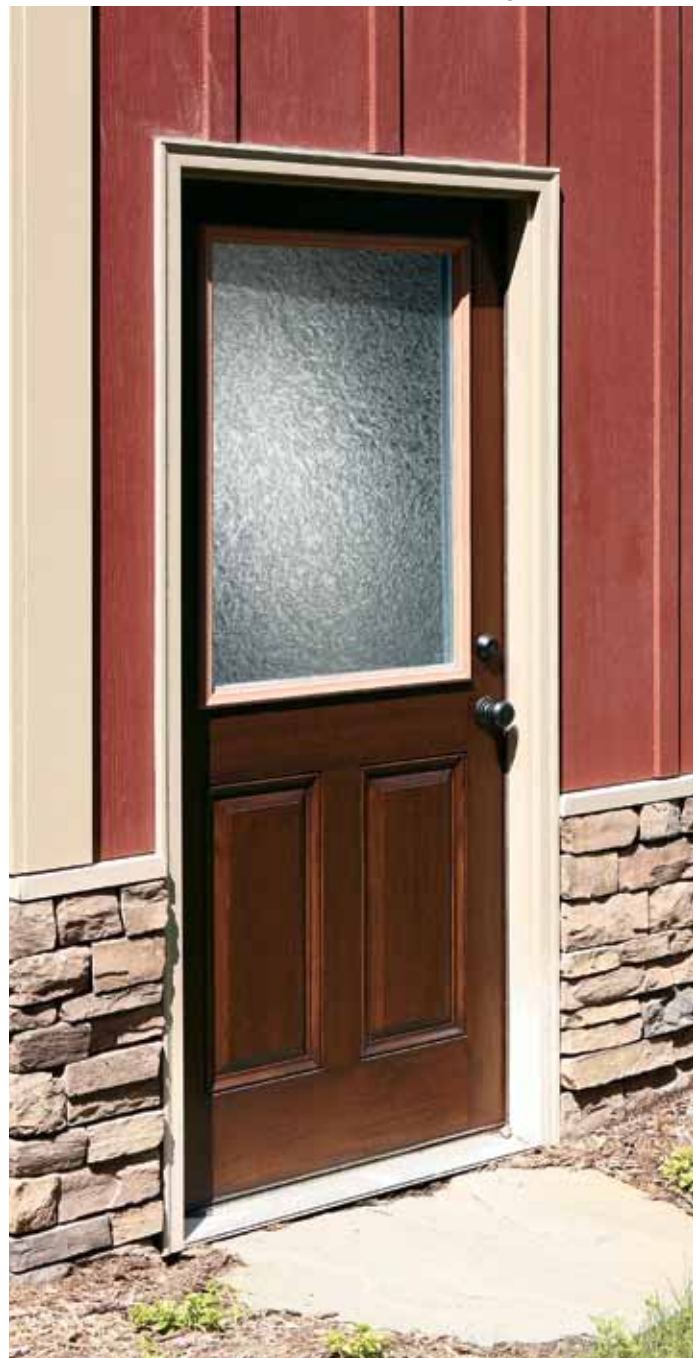
818-DGC* 819-DGC* Sidelight