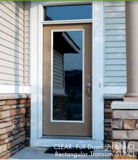
CLEAR: Full Doorlight 686-CL Rectangular Transom 517-CL