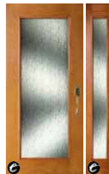
686/687/624-RN 694/690-RN Sidelight