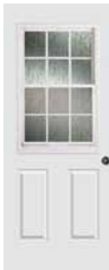
799-RN/GBG Privacy Glass