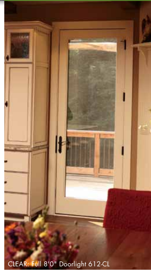
CLEAR: Full 8'0" Doorlight 612-CL