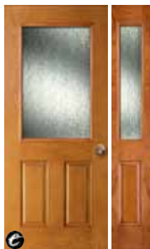
684-RN 692-RN Sidelight