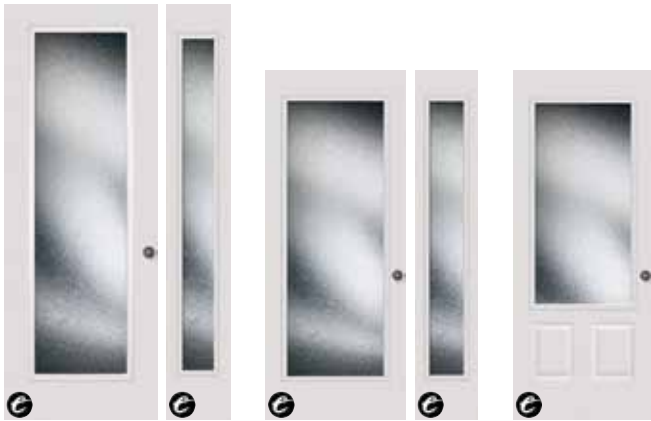
Full 8'0" 612-DGC 493-DGC Sidelight