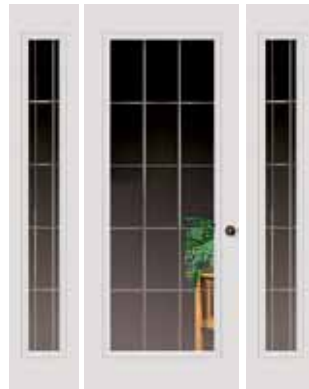
Full Doorlight 686/687-CC Full Sidelights 694/690-CC