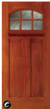
815-RN* 819-RN* Sidelight